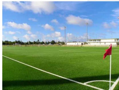
The Desso iDNA pitch is the first artificial grass field on the island of Guam.