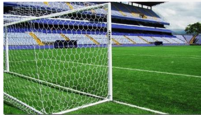
Desso iDNA at the Ricardo Saprissa Stadium in Costa Rica.

The stadium is by all means a true multifunctional venue. Not only does it host football matches, it was also used for concerts of e.g. The Black Eyed Peas and Shakira, and other events such as monster truck driving.