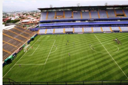
The pitch is the 1000 th FIFA Recommended Field™.

Desso Sports Systems | Robert Ramlotstraat 89 | 9200 Dendermonde | Belgium Tel. 0032 (0) 52 262 411 | Fax 0032 (0) 52 214 865 |