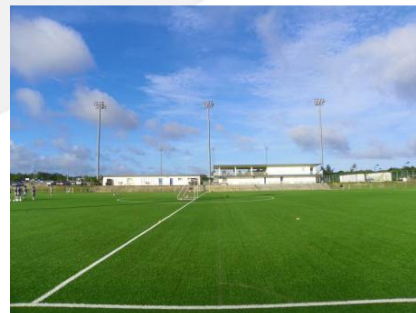
The pitch was installed with regard to Guam’s history of typhoons and heavy rains.

Desso Sports Systems | Robert Ramlotstraat 89 | 9200 Dendermonde | Belgium Tel. 0032 (0) 52 262 411 | Fax 0032 (0) 52 214 865 |