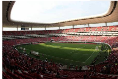
Estadio Omnilife was perfectly integrated in its green environment.

Artificial turf was an obvious choice here. No water is required for sprinklers and maintenance costs are considerably lower. Moreover, playing on an artificial turf pitch is always possible, no matter what the weather conditions are.