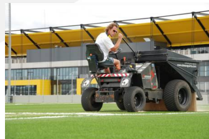
During installation, only light equipment was allowed on the 10 m high roof.

Desso Sports Systems | Robert Ramlotstraat 89 | 9200 Dendermonde | Belgium Tel. 0032 (0) 52 262 411 | Fax 0032 (0) 52 214 865 |