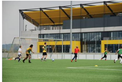
The youth division of Alemannia Aachen now trains next to the Tivoli Stadium.

Meijer: “The first experiences with the pitch are great. The sub base is perfectly adjusted for technical training sessions and sliding-tackles can be performed perfectly.”