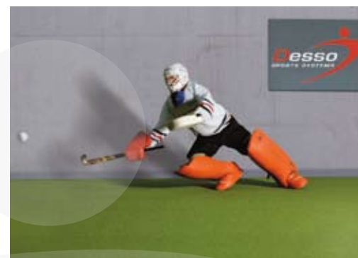
Desso Trophy Hockey test at Desso Sports Systems