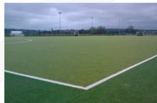
Park Lane High School South Halifax UK

Desso Sports artificial turf should be installed according to Desso Sports Systems installation instructions. Maintenance is the basis for retaining sportfunctional properties and appearance level.